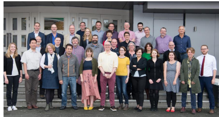
CaCHE team, September 2017