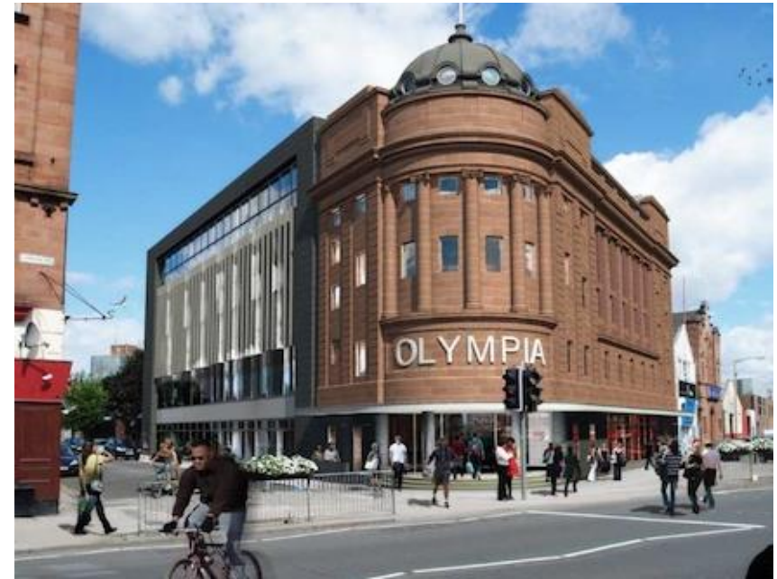
Olympia Building, Bridgeton, Glasgow